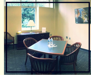
Employers Can Enjoy a Private On-Campus Interview Suite

Wake Forest University School of Law - Office of Career & Professional Development 1834 Wake Forest Road | Worrell Professional Center | Suite 1213 | Winston-Salem, NC 27109 p. 336.758.5721 | f. 336.758.3709 lawcareeroffice@wfu.edu | career.law.wfu.edu